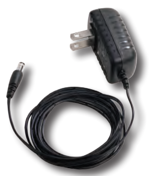
12V DC Power Adaptor